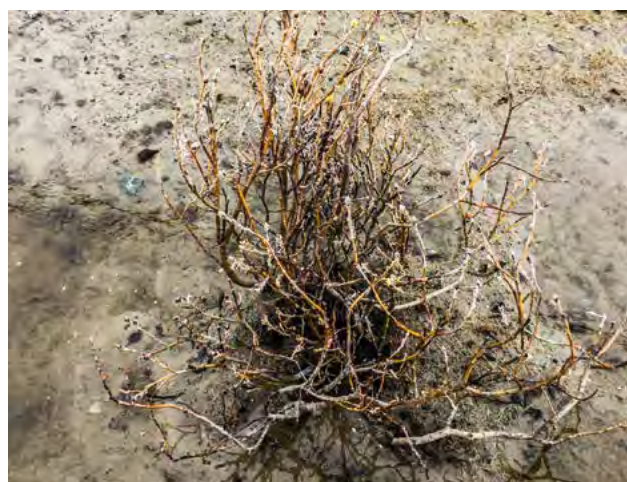
Lichen is the main food for reindeer.

by Novatek were too few and they were not divided equally between the herders, with some of the families remaining only within several days' reach of a phone. As a result, medical workers do not always arrive in time for childbirth, which may result in infant mortality. Cases of children dying of pneumonia and tuberculosis are also common. As the example with the outbreak of anthrax in the area around Tarko-Sale trading post in July 2016 shows, lack of communication between the private herders and administrative centre (which has a connection to the mainland) also plays a critical role in emergency epidemic situations. It is known, for instance, that the first reindeer died on 7 July, near the mouth of the Nerosaveyakha River in the area of Lake Pisyoto. Herders travelled for several days between reindeer camps in order to report the outbreak before they reached Tarko-Sale trading post and could report the outbreak to the mainland. Veterinarian help arrived at the site more than a week later, on 16 July, and the evacuation did not begin until 25 July, which resulted in the death of more than 2,000 reindeer, plus 23 nomads were infected and a young boy died of the infection. 80