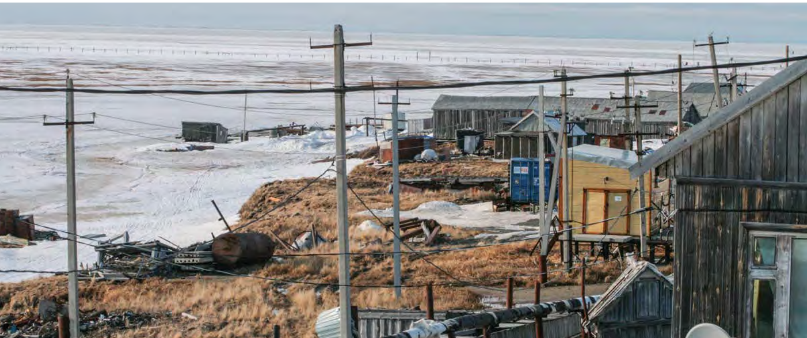
View from indigenous people's housing in Seyakha into the tundra.

The village of Seyakha is situated on the eastern shore of Yamal Peninsula near Ob Bay of Kara Sea. It was established in the 1930s on the basis of primary associations of reindeer breeders merging with trading posts, which appeared in Seyakha in 1927. In 1933, Seyakha became the centre for the Nei-to Rural Council (renamed into Seyakha Council in 1976), and by 1935, an elementary school located in a small wooden building had opened its doors to 40 students. At the turn of 1961-1962, Seyakha became the central estate of the state enterprise ( sovkhos ) 'Yamalskii'. At that time there was only one building on the settlement territory: a wooden hut for two families, which simultaneously served as the office and central manor of the sovkhos and the administration of the Nei-to Village Council. By 1963, 178 state families were working for the sovkhos. Altogether, there were twenty brigades: nine