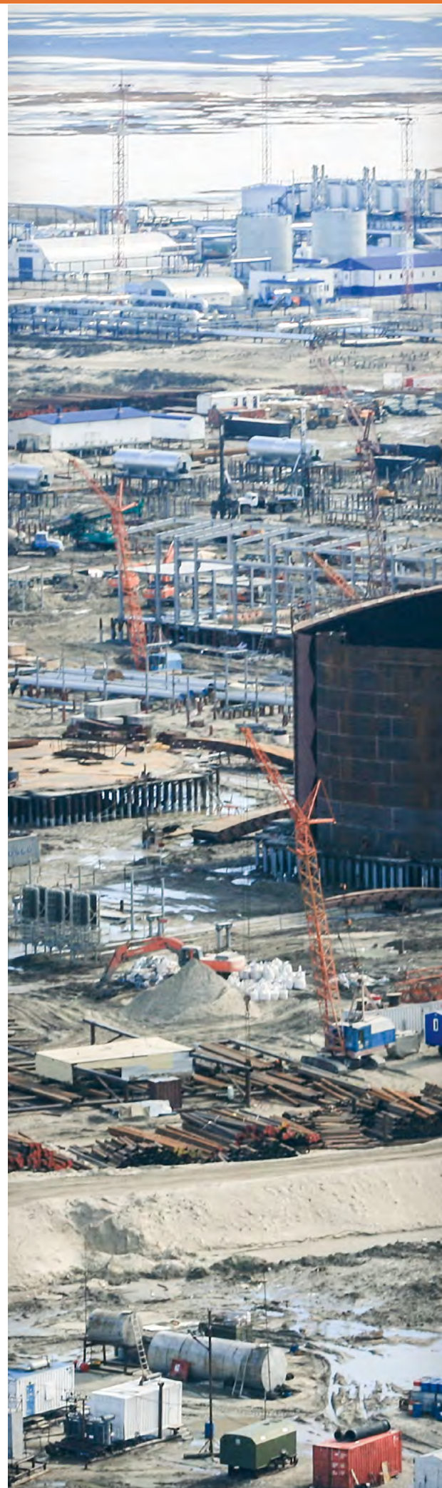
Gas and Oil production at Mys Kamennyi

strategic decisions and those people who are actually affected by the gas industry. Instead of benefiting from the project, the nomadic reindeer herders are subjected to forcible relocation, social injustice, harassment and violence. Banned from their lands, the nomadic families often find themselves left to the mercy of fate, without shelter, money, skills or resources. So far, the Nenets' mobility has enabled them to maintain control, along with their unique culture and language. Yet, while Novatek is preparing to expand its power and its territory (there are rumours that more pastures are going to be assigned to the project), the Nenets' mobility, and consequently their ability to sustain their cultural uniqueness and way of life, are shrinking along with their pasturelands. The indigenous people today are worried about their future. Many believe that the tundra "will eventually take what is hers." Their question, however, is whether the peninsula will withstand the pressure, and whether the people will survive along with it.