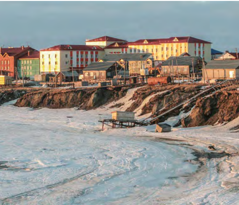
New School buildings in Seyakha, with the old soviet indigenous housing in the front row.

survive in difficult conditions of political and economic change 27 .