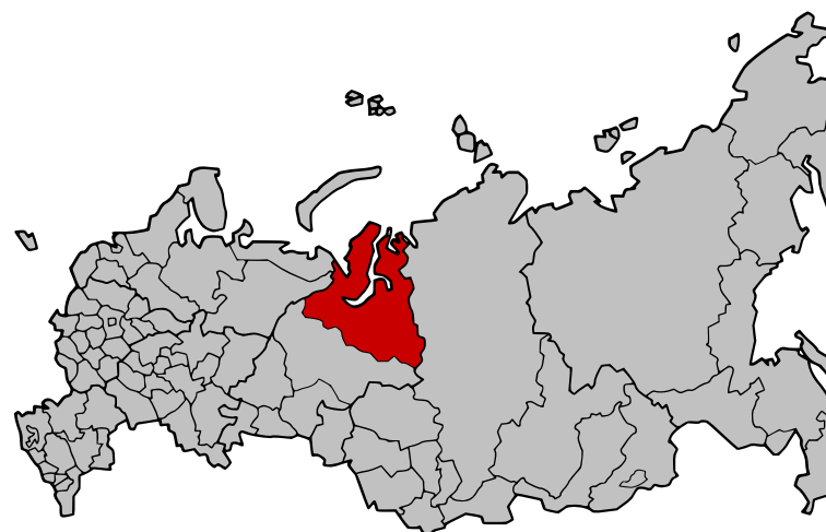
Yamal-Nenets Autonomous Okrug

In 2013, in order to feed the growing European and Asian demand for natural gas, Russia's largest independent gas producer, Novatek, in cooperation with the French energy giant Total, launched the Yamal Arctic liquefied natural gas project, known as Yamal LNG Project. The Project is aimed at upstream production, as well as processing, liquefaction and offloading of natural gas and stabilised condensate from the Project Site near the South-Tambey Gas Condensate Field on the east coast of Yamal Peninsula. It includes the construction of a major integrated complex for the liquefaction of natural gas, consisting of three process lines, each with an annual production output capacity of 5.0-5.5 million tonnes of LNG (15-16.5 million tons per annum) along with facilities for the production of one million tons of gas condensate per year, plus the sea port and an ice-class tanker fleet located in Sabetta, aimed at providing year-round delivery of LNG to markets in Europe, North America, and the Asia-Pacific regions 5 .