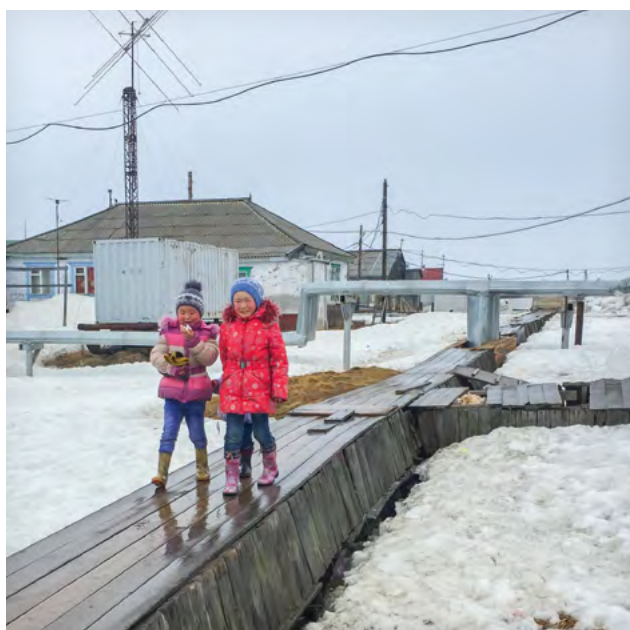
Two local girls, Seyakha.